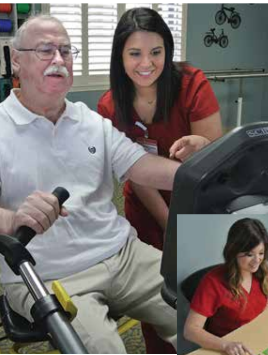
Rehabilitation and Fitness Center